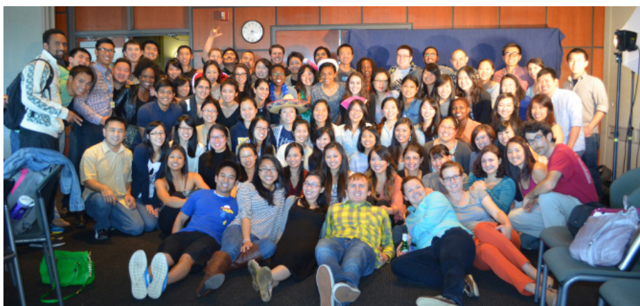
The Class of 2016 gathered together for a picture at their halfway celebration last year.

To my President Support Group: I can honestly say I don't know where I would be