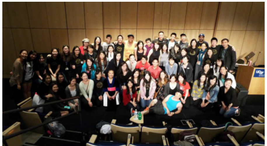
Zeta Chapter after showcasing their talents in Cole Hall.

to their successors. The P3's go onto rotations, and the P4's become pharmacists. While change can be scary, we should embrace it rather than fear it; solace can be found in the fact that if you fall, your brothers will be there to catch you... time after time.