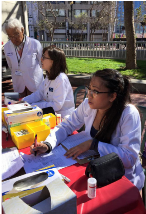
Project Healthy Heart volunteers providing total cholesterol screening to the public.

With the intention of bringing pharmacy and health services closer to the underserved communities, COSA kicked off this quarter with two health fairs at Heart of the City Farmer's Market in the UN Plaza Civic Center. At our first health fair, we had two screening projects (Project Healthy Heart and Operation Diabetes) and four informational projects (Project Asthma, TAP, Men's Health, and Safe Medication Disposal) participate. They each gave free health screenings and valuable health information to the local community. At our second health fair, we collaborated with two other UCSF-affiliated organizations: Script Your Future & the American Association of Women Dentists. It was a great experience working alongside other healthcare professionals and seeing the difference they can make.