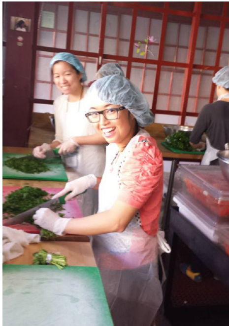
Two P1 brothers volunteering their time to make meals for those in need.

Big and little Reveal proved to be a fun night for all the brothers. Two giant busses shuttled us around San Francisco. Sometimes we forget we live in a picturesque vacation destination until events like this. We first visited Pier 39, a tourist attraction that is much more enjoyable when UCSF students are taking it over. Sipping on hot chocolate while listening to sea lions barking as the fog sets in is a uniquely San Francisco experience. The next stop was