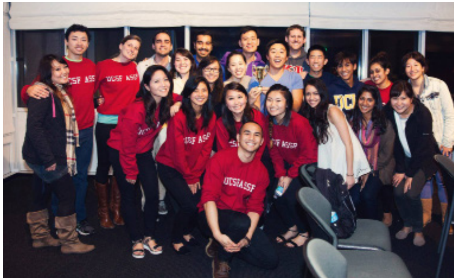
The P2 class commemorating a fun and successful win at Trivia Night!

I would also like to send a warm, bittersweet farewell to our P3’s who are leaving us for rotations. I know I am not