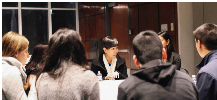
P1s learning about internship opportunities at CSHP's Hospital Internship Panel.

meet pharmacists from various settings over a delicious meal hosted with Alumni Association. Having all these successful events made it no surprise that our student chapter became recognized as a Student Chapter of Distinction by both ASHP and CSHP. Shout out to all the members for your support and our wonderful cabinet for making all this possible!