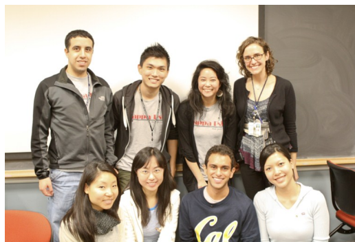
Student pharmacists enjoy a CSHP lunch talk

tion Diabetes provided screening and information to the underserved community in the Tenderloin. On March 1 st we had our