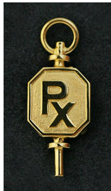
The Rho Chi Key Pin

You can find our wiki by logging into myaccess.ucsf.edu . Make sure all your apps are visible, then choose the last option on the page "Wiki@UCSF." Our wiki is titled "School of Pharmacy Phi Lambda Sigma/ Rho Chi Guide to Advanced Pharmacy Practice Experiences."