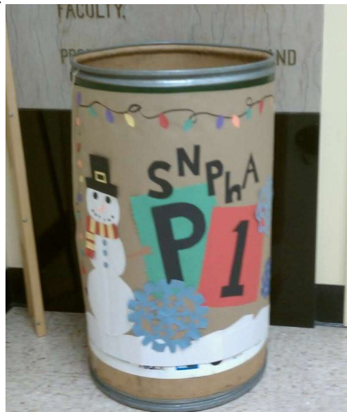
SNPhA members and non-members pitched in to help raise 300 pounds of food for SF Food Bank!

We hope you all are having a wonderful winter quarter and take some time to relax during spring break. See you next time!