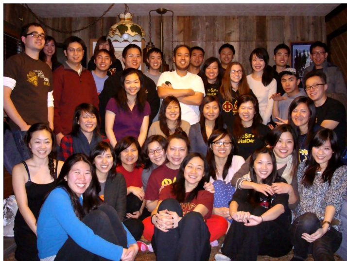
Phi Delta Chi members retreated to Tahoe for some snowboarding, skiing, relaxing and bonding with Brothers and Pledges

has provided invaluable memories and growing experiences for the fraternity, and we look forward to the opportunities that lie ahead.