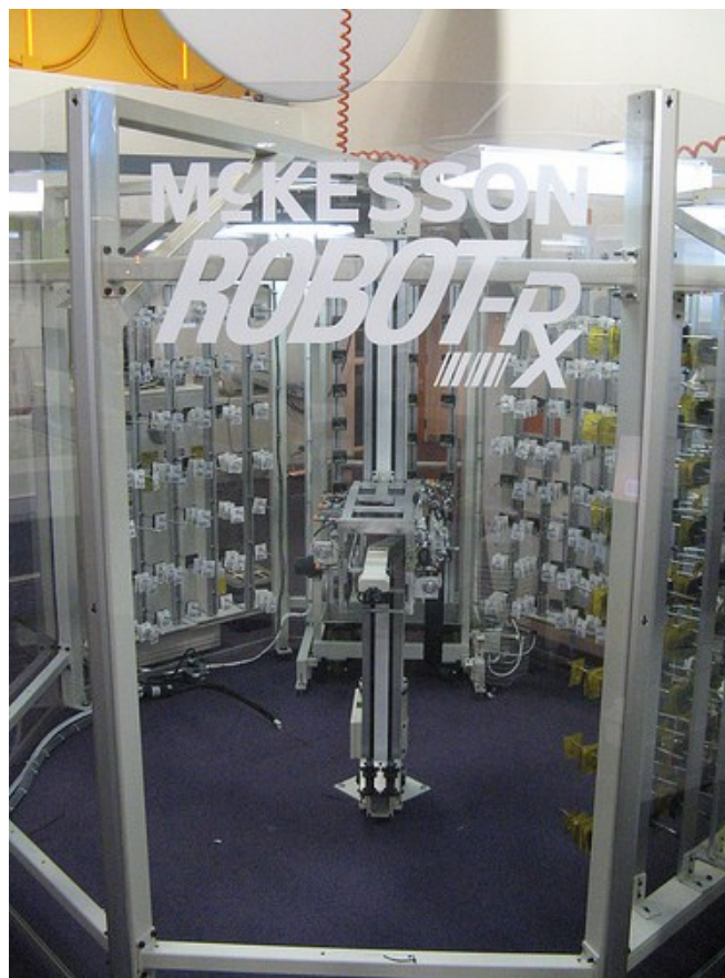
One of the McKesson Robotic Pharmacy Systems