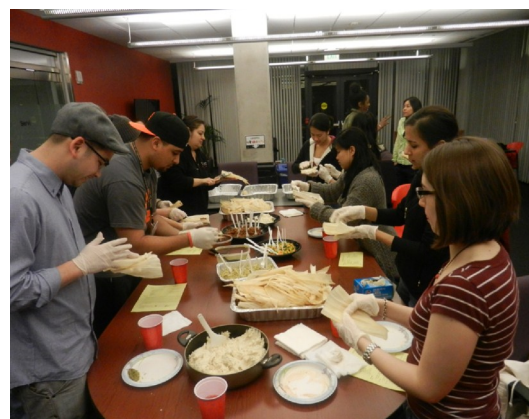
LAPS hosts the 2nd Annual Tamale Workshop

report that on March 10th we will be hosting a health fair at La Raza community resource center in the Mission district. We are thankful to APhA and NCPA for helping us carry out our mission statement of bringing health services to the medically underserved Latino community of San Francisco.