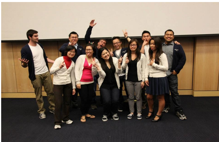
ASSP Cabinet showing their goofy side