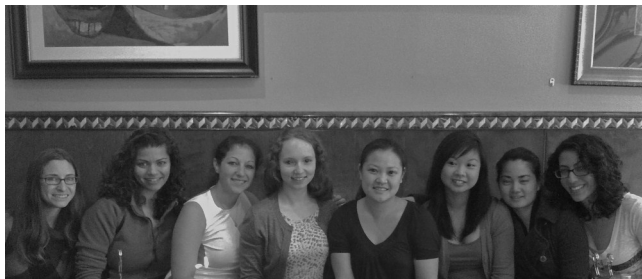
The outgoing and incoming cabinets for the Class of 2014