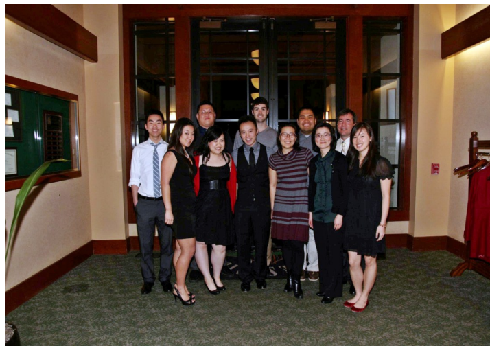
The outgoing 2011-2012 ASSP Cabinet

However, I think it is wise for us to take a step back and look at the “Pharmacy Bubble.” We (myself included), have been playing a dangerous juggling act of school, internships, organizations, and many more extracurricular activities. Despite the success of many of these programs, I often wonder to myself, “Why do we do this?” I would like to think that each of us have our own personal reasons. However, it is important to note the distinction between pushing personal boundaries to achieve goals and passions, and seeking out numerous opportunities because that is the perceived expectation. One of the most challenging things we do as student pharmacists is connecting the activities we do with our professional and personal goals. As the school