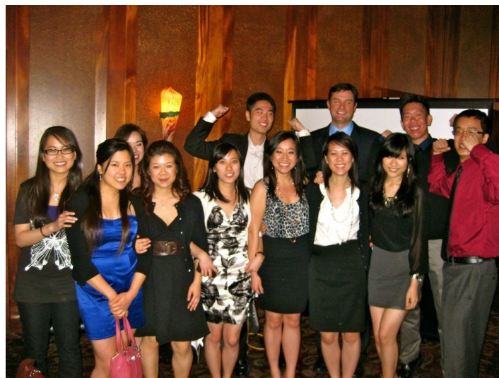
Phi Delta Chi Officers for the 2012-2013 Year

of school and enjoy the company of fellow brothers. Whether it be braving the brisk SF outdoors for BBQ's and potlucks, watching a movie, or salsa lessons, at PDC we always make a conscious effort to develop and maintain strong friendships. To all that have joined us in the past, thanks for the memories and laughs. If you haven't had a chance to join us yet, we look forward to seeing you soon.