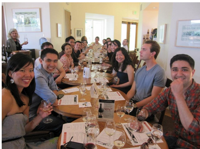
A group of P1's enjoying themselves in Napa Valley

perclassmen for their guidance. Thank you for taking your support and mentorship throughout our first year. Your big hearts and positive energy helped us develop into caring, knowledgeable, and balanced student pharmacists. As we go into summer and start our internships, we are excited to let everyone see the caliber of students after just one year of pharmacy school.