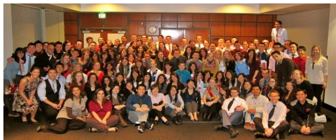
The brothers of Kappa Psi