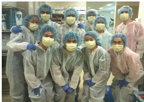
Students visit the Mission Bay robotic pharmacy

dents how they could advocate for pharmacy and continue the efforts started during the joint CSHP/CPhA Legislative Day in March. For the first time this year, CSHP members participated in an exclusive tour of the Mission Bay robotic pharmacy which gave students a glimpse into the future of pharmacy and the benefits automation may provide in improving patient safety. And,