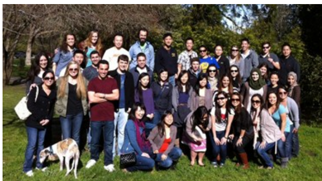
Members of the P4 class gathered in Golden Gate Park for a BBQ