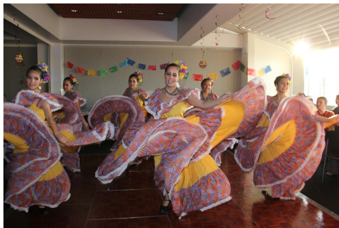
LAPS welcomes El Gusto Mexicano Ballet Folklórico