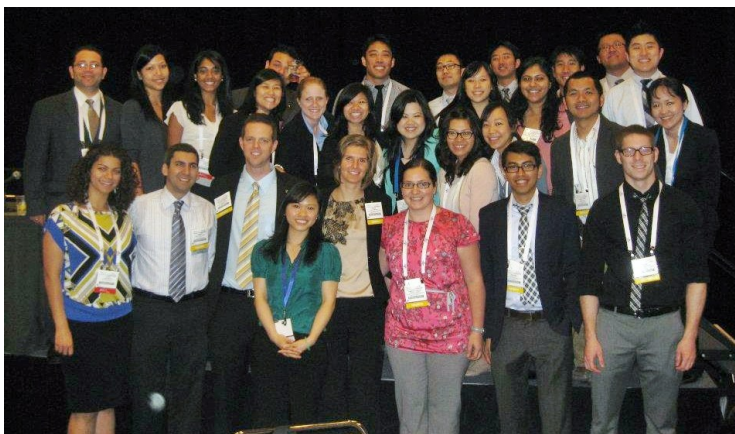
Student pharmacists enjoy the AMCP Annual Meeting & Expo in San Francisco

innovative ideas and goals for our student chapter. As president, I am so unbelievably lucky to work with these individuals. I look forward to building and growing with these visionaries by my side.