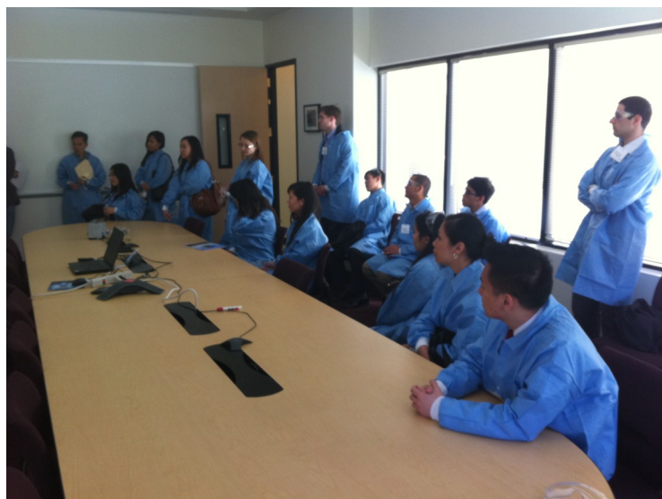
A group of UCSF Student Pharmacists at the Gilead Science Corporate Campus in Foster City, CA.

Finally, I would like to say that it has been a pleasure serving as your ASSP VP of Professional Affairs. Best of luck with all your future professional endeavors.