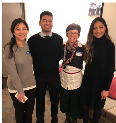
A big thanks to our P&T coordinators and AMCP faculty member!

This past winter quarter has been one of many successes in our AMCP chapter. The culmination of our P&T competitors' work over the past several months, as well as our P&T elective coordinators, finally reached its apex: the P&T competition! This year's competition involved over 30 incredible student pharmacists,