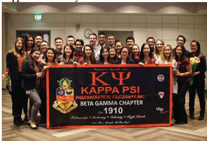
Welcoming our newly initiated brothers!

Between braving the seemingly coldest of winters and battling the incessant rain in San Francisco, the brothers and pledges of the Beta Gamma chapter have had yet another busy quarter.