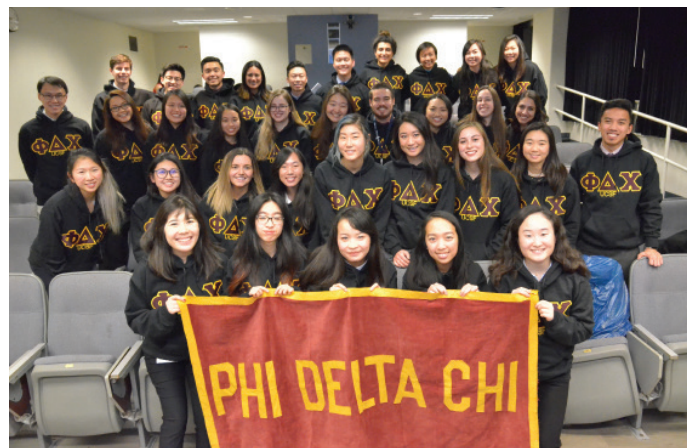
Newly initiated PDC brothers showing off their official sweaters

We're sad the P3s will be leaving, but excited for the new board to implement their visions for the year to come!