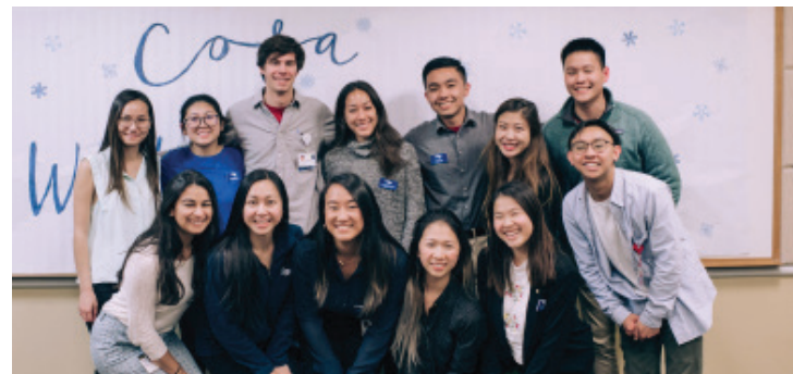
COSA Winter Auction Committee members:

Lastly, COSA concluded the Winter quarter with interviews for Board and Project Coordinator positions in preparation for the upcoming year. We are excited to welcome a new group of eager students in expanding patient care and outreach! We would also like to thank our dedicated project coordinators, advisors, and preceptors for their commitment to serving the community this past year.