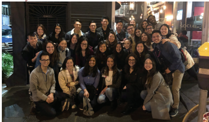
P3 Sunset Bar Crawl: P3's made their last call around the bars in the Sunset