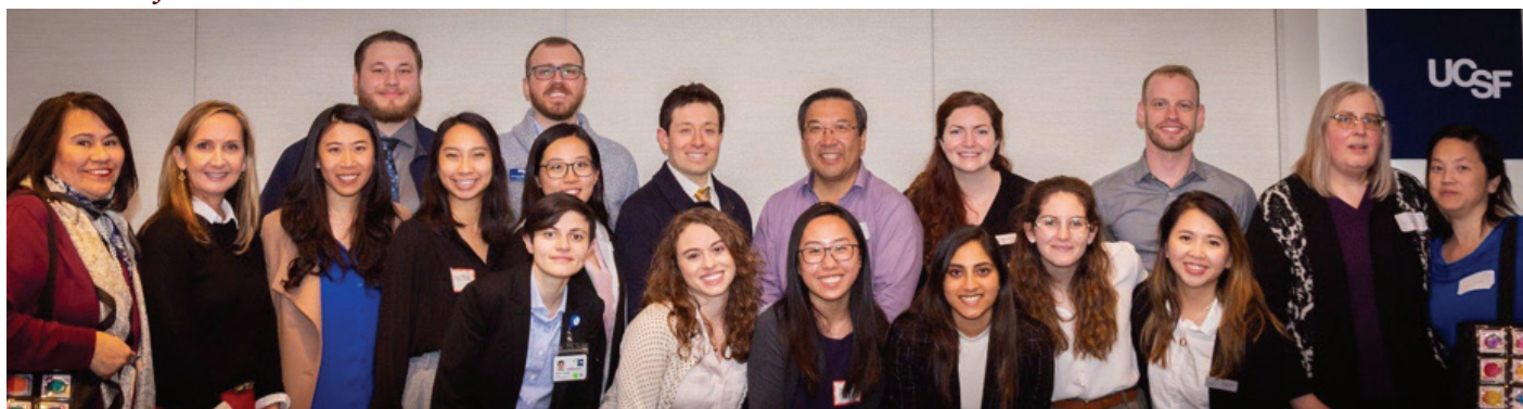
Members of NCPA and ACCP with the incredible group of speakers from the 2019 Winter Roundtable.