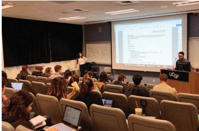
P1 Summative Exam #2 Review Session.