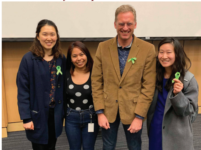
Mental Health Awareness Night