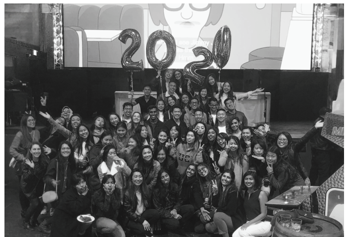
P3 Send off: The class of 2020 saying our final goodbyes at Emporium SF

Biktarvy became our drugs of choice, and we have now become experts at handling five group projects at once. It's bittersweet that our time at UCSF is coming to an end, but we were lucky to share a plethora of moments that sparked much joy such as the Blind Dinner Date Social and Sunset Bar Crawl. As we move on to our rotations and tackle new challenges, remember that we always have each other. We look forward to reuniting next year!