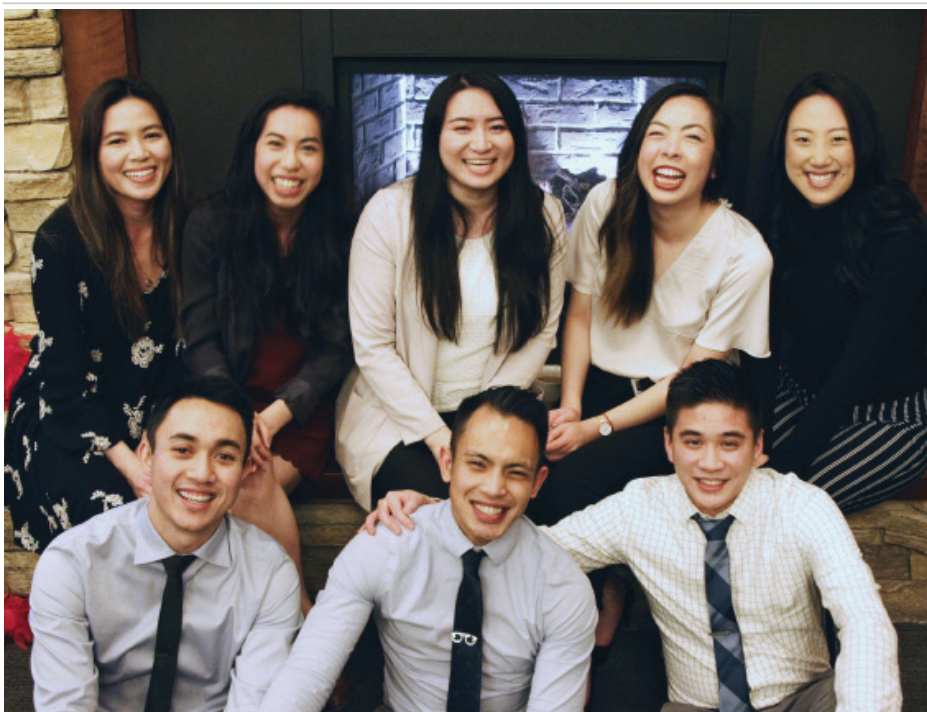
ASSP Board 2018-2019