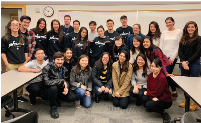
Mock Interview Day!

Mentors and mentees at the end of a very productive Saturday