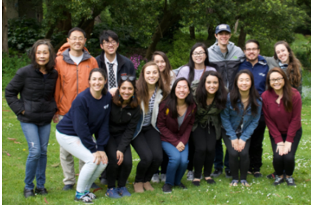
Students and faculty pose for a group photo in Golden Gate Park at the first annual "Spring into Wellness" event hosted by the P1 committee.