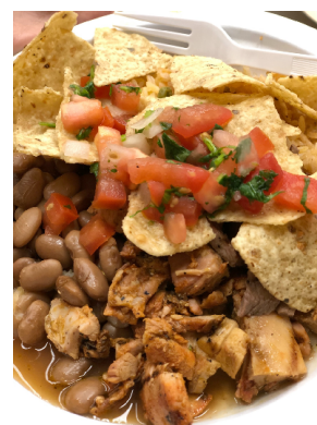
The lunch we served at Spanish Lunch Talk containing pollo asado, Spanish rice, beans, nachos, and pico de gallo

We have many more exciting events planned for the future! Keep up with us on Orgsync ( https://orgsync.com/62252/chapter ) to get the latest news.