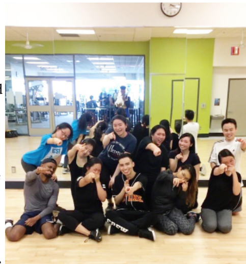
Happy and hopeful P2s after an amazing group exercise class

a breather, you deserve it. Alexa, Play "Good Riddance (Time of Your Life)."