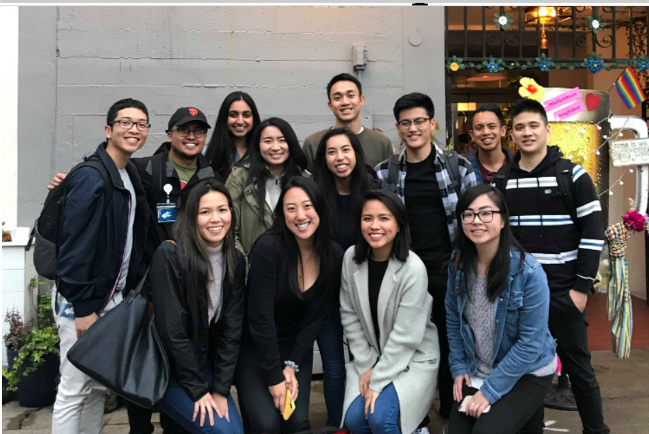
ASSP Board 2019-2020