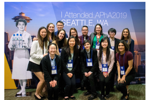
Students pose with "Grandma" at the APhA Annual Meeting and Exposition in Seattle Washington in March 2019.

and took away a few great lessons for next year's event. Our P1 committee also hosted our first annual Spring Into Wellness event where we talked, played Jenga, and relaxed in Golden Gate Park. Lastly, we hosted our end of the year banquet at the Faculty Alumni House where we enjoyed Thai food, reminisced over the great memories, and installed our new board members.