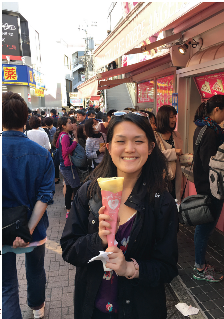
Happiest when fed. Even happier when it's dessert. Ft. a delicious crepe from Harajuku (Tokyo)

it takes awhile for new members to grow on me. Modern Family is the only one that I'm currently following in real time (and a little bit of Grey's).