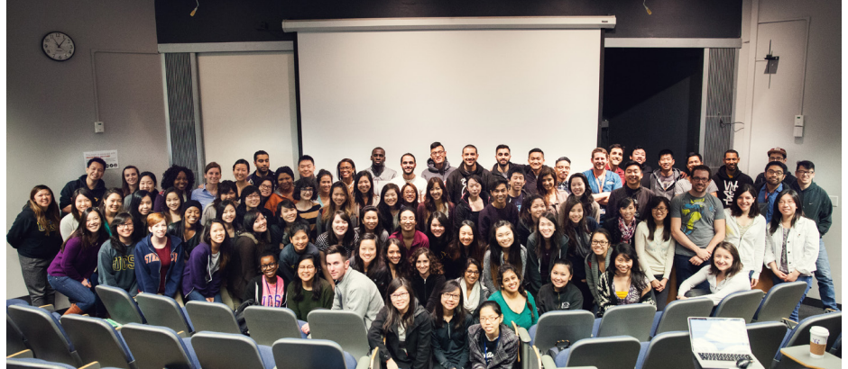
A rare, but lovely moment with the class of 2017, all together.