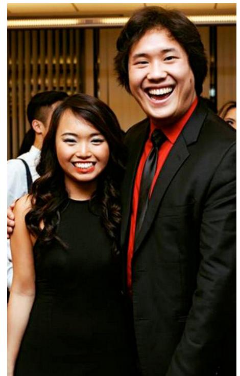
Big smiles from you new ASSP VPs of Social Affairs!

Our goal for next year is to maintain the traditional events and introduce some new and exciting additions as well. We’d also like to have more events between the different schools at UCSF, so that we can better know our counterparts in the other professions. If you have any ideas or words of wisdom for us, please don’t hesitate to let us know! We’ll do our best to make sure we can all can enjoy yet another fun-filled year together!