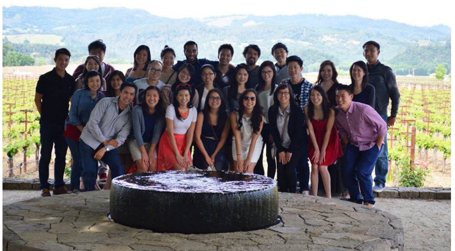
The Zeta chapter gathers for a group photo in one of Napa's many wineries.

ang, led the effort in gathering gifts and crafting handmade leis for all of our graduating brothers. Many of our brothers went to congratulate their bigs, grandbigs, and great-grandbigs on becoming PharmDs! Seeing all of these graduates reminds us of what lies ahead of us not only beyond the classroom, but pharmacy school as well. We wish all of our graduated brothers the best in their careers! With the school year coming to a close, the new PDC board looks forward to preparing for the next school year's adventure!