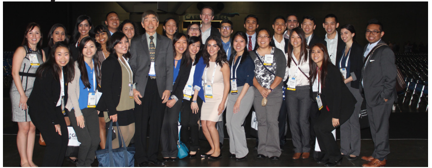
UCSF Delegation at the AMCP Annual Meeting & Expo, San Diego California, April 8-10

AMCP's goal is to further build on this momentum. We will continue helping students explore non-traditional paths of the profession while innovating new projects and events. We could not be in better hands: our newly elected 2015-2016 Board came in fired up and is already planning events for you in