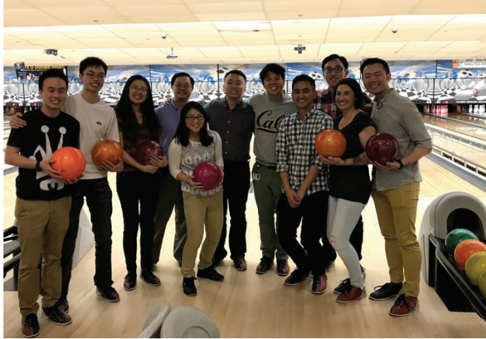
Pharmacists and students at our annual Bowling Night with Pharmacists.