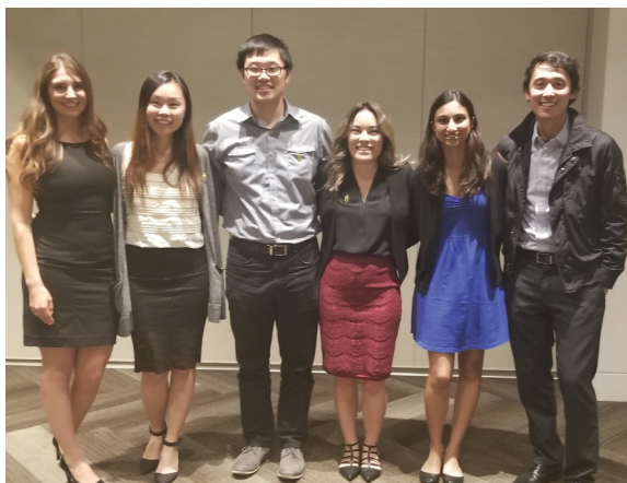
2018-2019 PLS Board