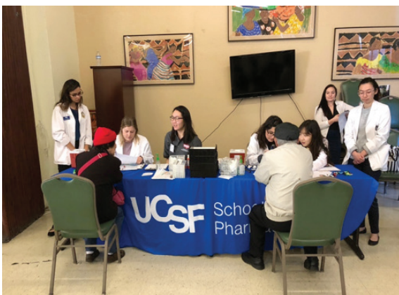
Operation Diabetes performs free blood sugar screenings at the Western Addition Senior Center.

Lastly, COSA concluded the winter quarter with interviews for Board and Project Coordinator positions in preparation for the upcoming year. We are excited to welcome a new group of eager students in expanding patient care and outreach!