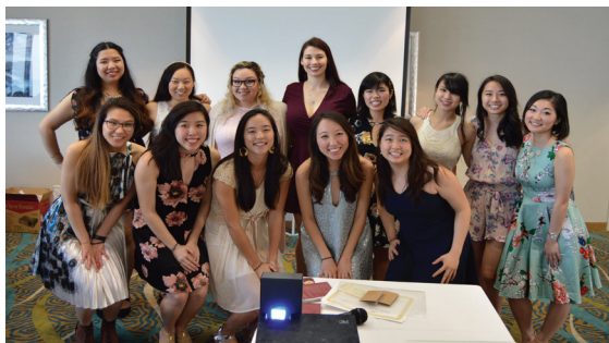
PDC board members gather to take one final photo together before handing off their duties to the next era of leadership

Winter may be the coldest season, but it is always the warmest time of year for the Zeta Chapter. From breathtaking photo-shoots by the lake to zeta days revolving around fun and food, this quarter was full of memorable moments and deepening friendships.