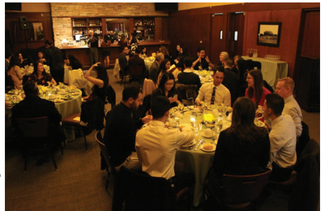
ASSP Banquet 2018

years, it brings to light the amazing contributions and the impact that each individual has had in our program. Thank you for all that you have done to help our student body flourish and to continue the magic that makes UCSF what it is. I wish you all the best moving forward to the next chapter of your lives and cannot wait to see the amazing things you will do for our community.