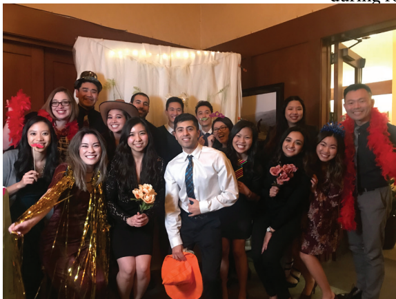
P3 RCO leaders pose at the ASSP Winter Banquet

to do rotations without you all either. Class Cab/ARTS/STARS/RATS would like to thank you all for entrusting us to represent your voice during the year, and we are excited to see what the new P4 Class Cab has in store for us. It has been a great year, but the best is yet to come. Time is going to fly, and we’ll be back in HSW for law review before we know it!