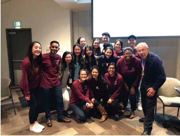
ASSP Trivia Night