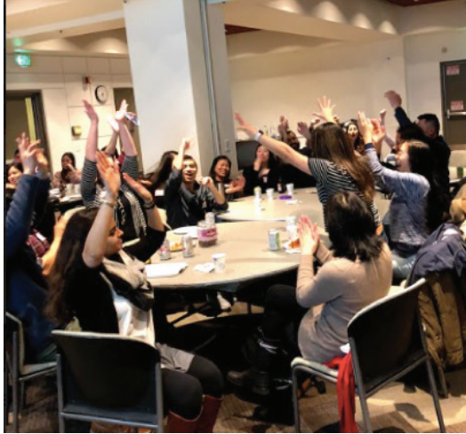
P3 Class at ASSP Trivia Night

I have always held true to the statement to never let others shape your experience for you. However, I have now discovered a profound appreciation for all the individuals who have influenced my life at UCSF thus far. This time of divergence brings bittersweet feelings,