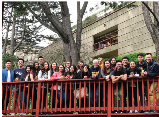
Celebrating our P3s as they prepare to head off onto rotations after this quarter

As I near the end of my term, I can now clearly see the growth in both myself and my fellow board members. Their passion, kindness, and strength were an inspiration, and I am so incredibly proud of each and every one of them. Truly, the support and unending friendship I have found this year is a feeling that will resonate with me forever.