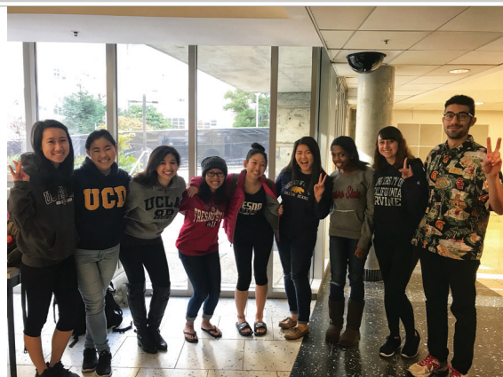
P3s rep their undergrad!

My one request is for all of us to stay connected during rotations. Schedule a time to check in with each other! Grab a drink after work, spend your lunch breaks together, throw housewarmings, parties, game nights, share stories from your shifts—however you see fit! We are approaching inevitable stress ahead, and every bit of support counts. To my amazing P3 classmates, I could not have done pharmacy school without you all. I don’t think I’ll be able