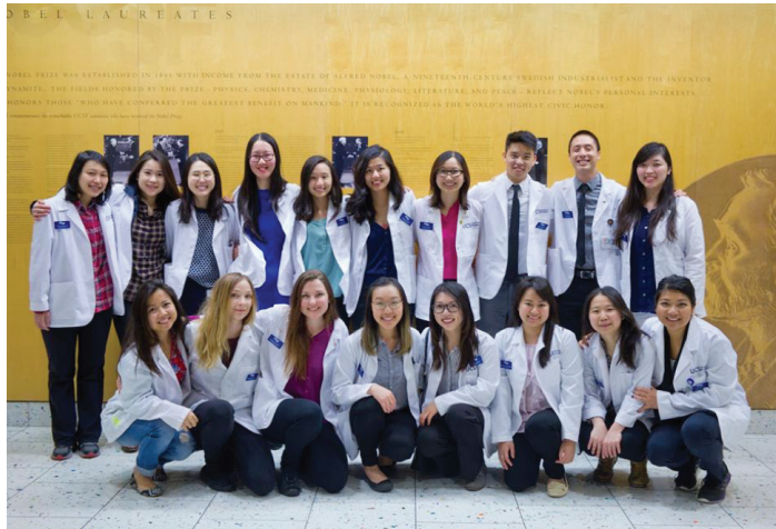
Class of 2018 students celebrate the end of their last OSCE before embarking on rotations.