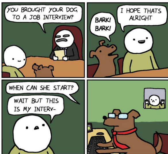
Comic By: EatMyPaint