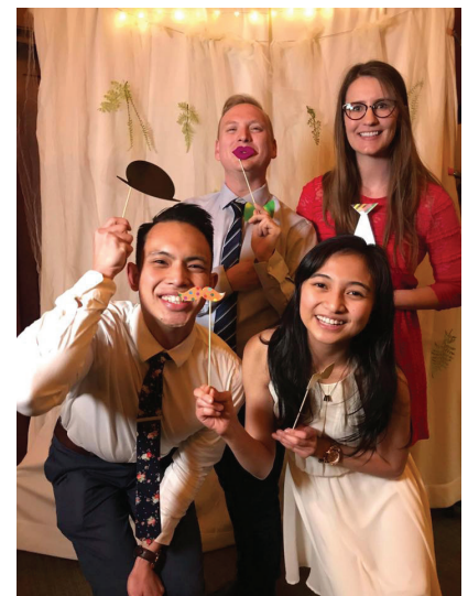
P1 Class Cabinet at ASSP banquet

But even despite all of this going on, the class of 2021P still had time to have fun as we danced the night away at the GPSA formal and showed off our knowledge at ASSP trivia night. Our first year has gone by faster than we could have ever imagined but we look forward to continuing to learn, developing bonds, and ending the year strong!