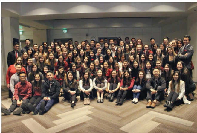
The brothers of Kappa Psi Beta Gamma are proud to welcome in 48 newly initiated brothers.

As this quarter comes to an end, there are many events to look forward to after the spring break including: Board Elections, Napa trip, Spring Banquet, and Graduation!