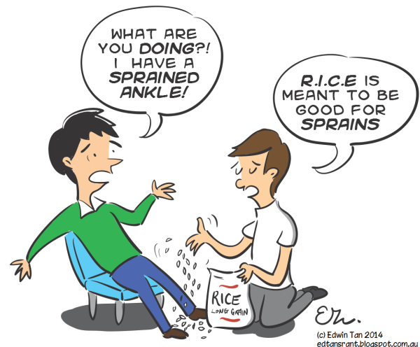
Comic By: Edwin Tan