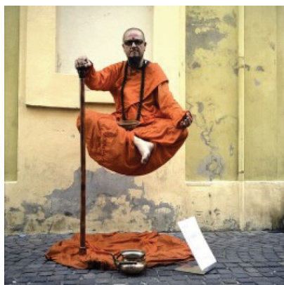
Example of an Indian Yogi Levitation Act