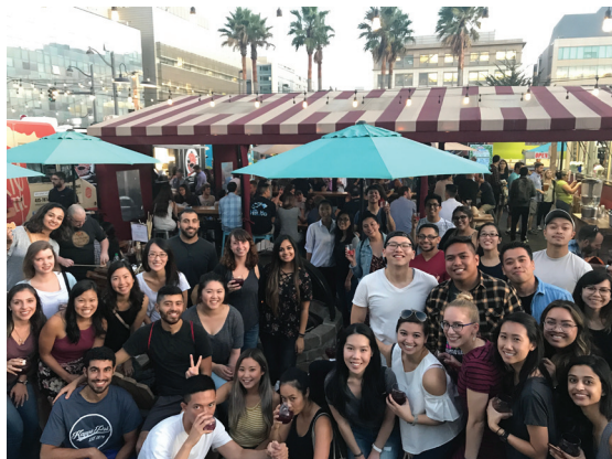
Newly minted P3s enjoying their last bit of summer at SPARK

seminar in Las Vegas, our 3rd annual Class of 2019 Friendsgiving, a successful P1/P3 ice cream social, invigorating group exercise classes, photos from our first ever #sP3ritweek, and many others. Let's head into our final didactic quarter with the same momentum, and may the laughter, smiles, inside jokes, and happy hours never cease.