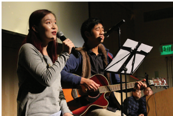
ASSP Skit Night