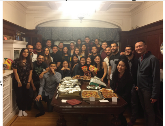
P3s gathering for their 3rd annual Friendsgiving dinner

Being lost in these busy moments during pharmacy school has allowed me to truly appreciate and cherish the times that we have with each other. We close out our last fall quarter here at UCSF with memories of our huge presence at CSHP