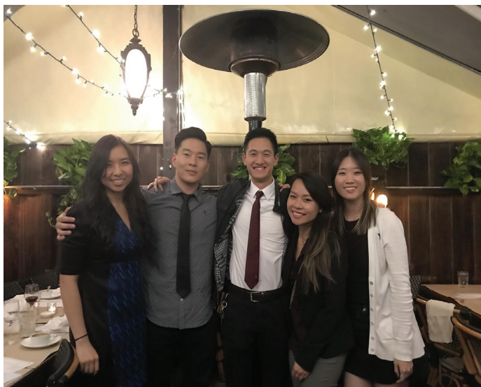
Rho Chi Board

The Rho Chi Society is the academic honor society of pharmacy and offers membership based on academic achievement. Over the past years, one of the trademark characteristics of UCSF's Rho Chi Society has been its fluidity. The organization has maintained a flexibility to operate differently almost every year while maintaining one guiding vision: to encourage intellectual leadership and support the students in their academic endeavors. This Fall, Rho Chi initiated 10 members from the Class of 2018 and 13 members from the Class of 2019, and we are excited to put our vision into action for your benefit!