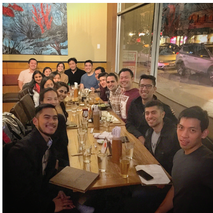
Current PLS members shared their experiences with interested applicants during our Meet & Greet

The Pharmacy Leadership Society membership drive has officially kicked-off this quarter! During the last few weeks many of you came out to our events to learn more about PLS, and what we do. Thank YOU