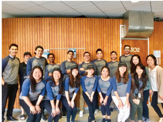
P2 Kaiser Interns