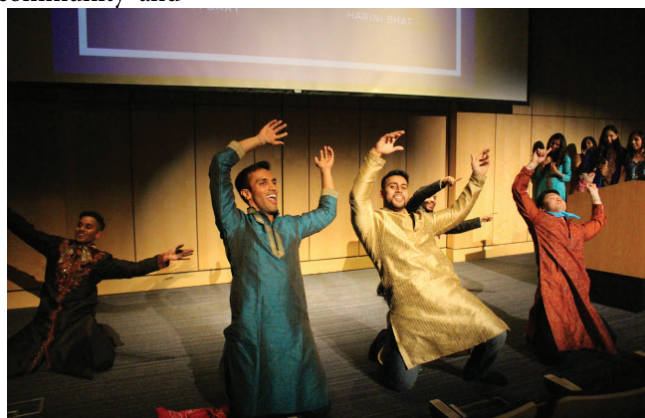
ASSP Skit Night

the future, is the result of the efforts of the entire student body. Thank you for participating in our conversations, providing insight for improvement and allowing us to progress student life at UCSF. With that being said, I leave you with pictures of the incredible acts at ASSP Skit Night 2017, which also could not be possible without the contributions and participation from all of you.