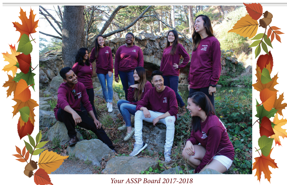
Your ASSP Board 2017-2018