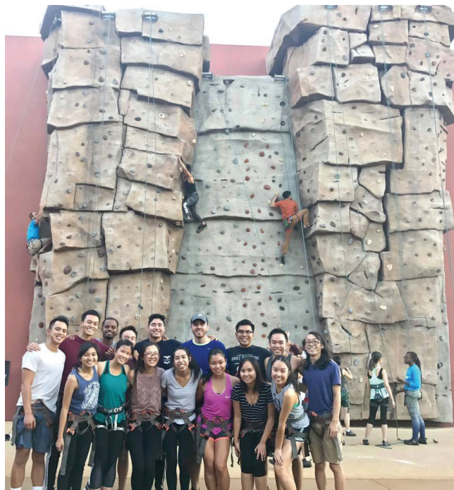
P1's Rock Climbing at Mission Bay!

Although we are just beginning to know each other, we are glad to be unified as a pharmily and look forward to making the most of the time we have at this university!