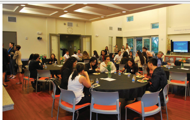
Another successful AMCP Roundtable with great students and leaders in the Pharmacy profession