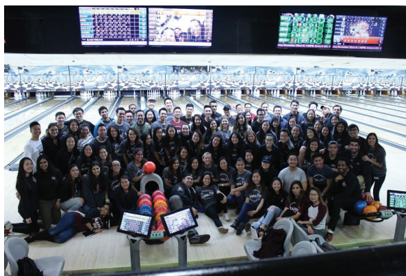
KY Pic 2.jpg An amazing bowling night after the First Pledge Meeting with the brothers and pledges.

energy among the brothers and potential pledges was exceptionally high and welcoming in all of our Fall Rush events. The lineup of rush events include: Info and Internship Night, Halloween Party, OSCE Prep, and a new addition of Pumpkin Carving. Furthermore, the PacWest Province hosted by the Epsilon Iota chapter at Sacramento, California was a wonderful experience and amazing opportunity to meet fellow brothers of our province and deepen connections. We look forward to attending the next one at San Diego, California. As rush season comes to an end, the brothers of Beta Gamma welcomed in 49 new pledges.