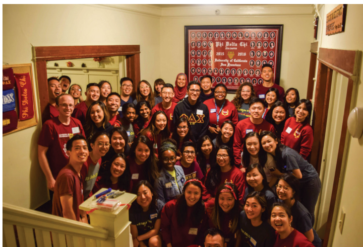
The brothers of PDC taking a moment to get together before serving the P1s dessert during BiFrat.

The rush of the season culminated in our Thanksgiving Dinner, where we were joined by brothers in all classes, our new prospective brothers, and our esteemed alumni. With the array of homemade food (and whole turkey legs!) and everyone looking on point in their dress-to-impress attire, we felt thankful for the brothers we have by our side and the brothers that we would soon gain into our PDC family.