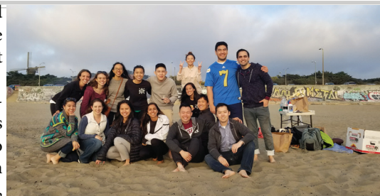
Fall Leadership Retreat organized by PLS gathered leaders from many RCOs to reflect on current challenges and opportunities for our organizations

If you were not able to attend our drive events, more application details including