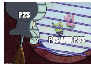
Meme Picture Credit: Jasper Hai

As we complete the first quarter of our P2 year, we realize that we are still learning and growing. In one short quarter, we have learned to make the best of the worst circumstances and remain steadfast to our goals. We are confident that each one of our P2 classmates is a game changer in our community and whatever struggles lie ahead of us, we will be prepared for it.