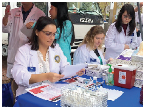
Student volunteers screened blood sugar levels and counseled participants on regular exercise and good nutrition.