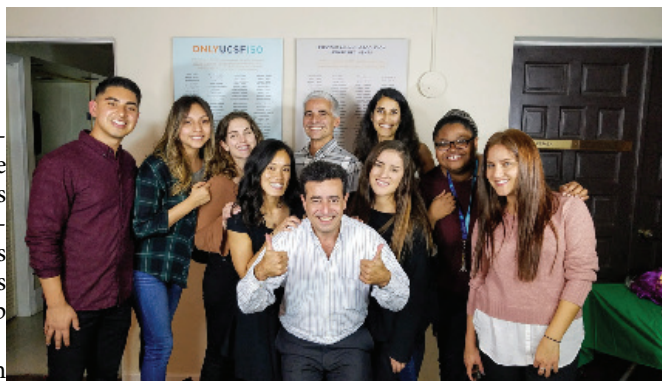
The LAPS Board celebrating a successful Tacos y Salsa Night with their Preceptor and MC/Salsa instructor for the night.

This year's Lunch Talk featured English to Spanish translations for common phrases that can be used among all health disciplines. Topics included how to introduce yourself, how to offer assistance, and performing a medical history. The Lunch Talk culminated with an exciting Jalapeno Eating Competition. Students pushed themselves to eat as many jalapenos as they could. Of course,